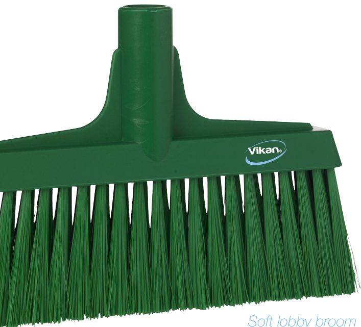
Soft lobby broom